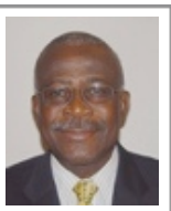
Kanayo Nwanze President, International Fund for Agricultural Development (IFAD)

Source: Imperial College, http://www3.imperial.ac.uk/people/g.conway ; DFID, http://www.dfid.gov.uk/research/NPT-Speaker-Biographies.pdf