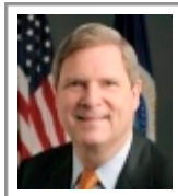
Tom Vilsack United States Secretary of Agriculture

Tom Vilsack became the Secretary of the U.S. Department of Agriculture (USDA) January 2009. Prior to that, Vilsack served in the public sector at nearly every level of government, beginning as mayor of Mt. Pleasant, Iowa in 1987, then as state senator in 1992, and as governor in 1998.