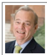
Gordon Conway Professor of International Development, Centre for Environmental Policy, Imperial College